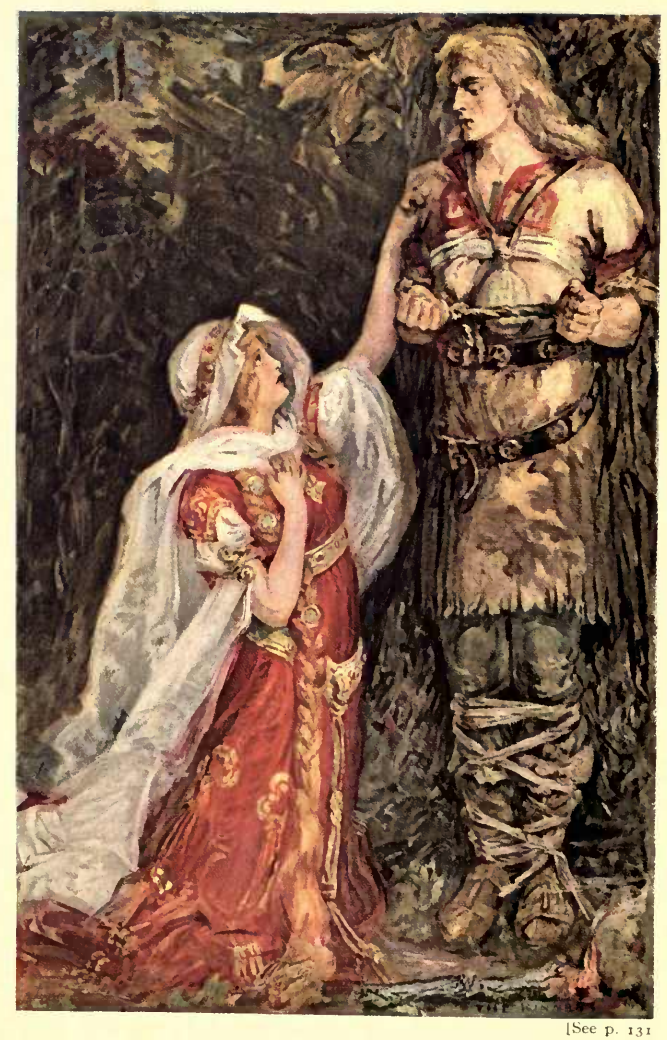
"SHE KNELT DOWN BEFORE HIM. . . . THE WOMAN IN HER PLEADED AS BEFORE A LAWMAN"